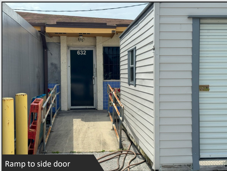
Ramp to side door