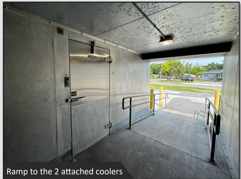
Ramp to the 2 attached coolers